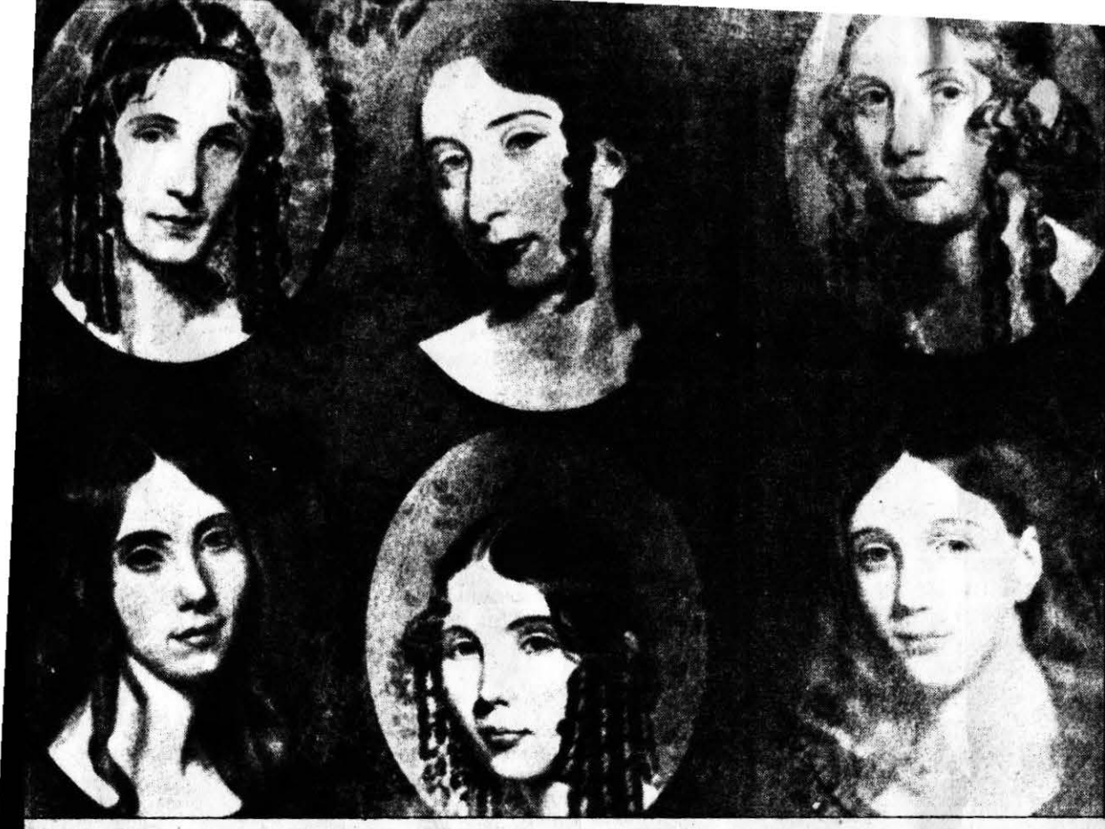
Hildreth Family Cemetery in Lowell (resting place of four generals)