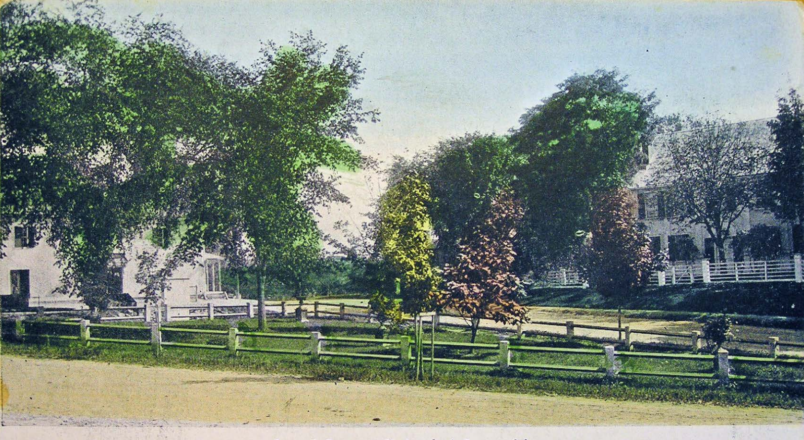
Central Square, Chelmsford Center, Mass.