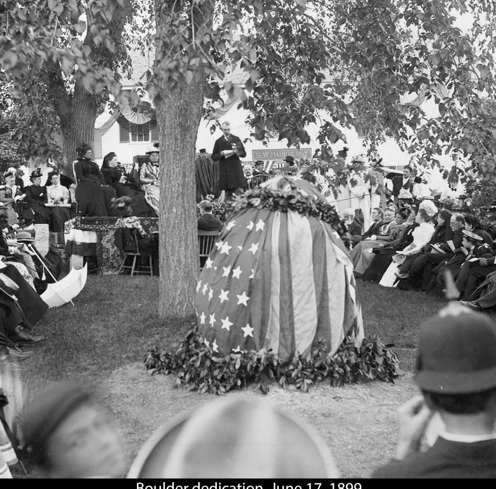
Boulder dedication, June 17, 1899 Courtesy of Chelmsford Historical Society, Index #bbh457